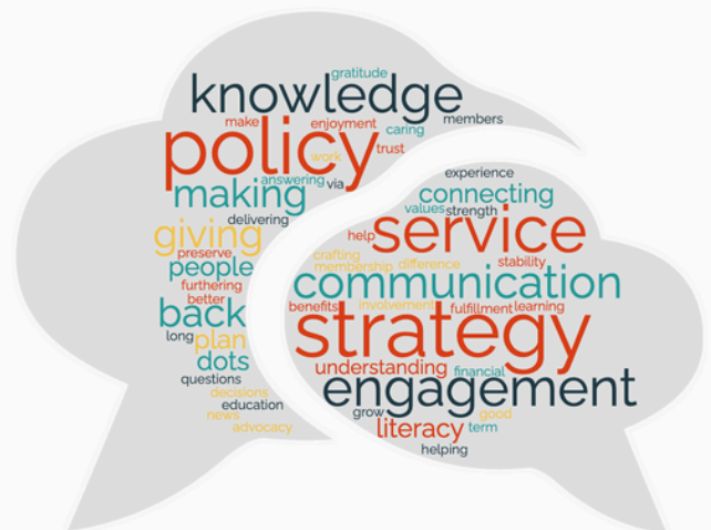
Word cloud created by gathering key themes and phrases from the breakout workshops.

Trustees play a key role in benefits literacy, transparency, and improving member engagement.